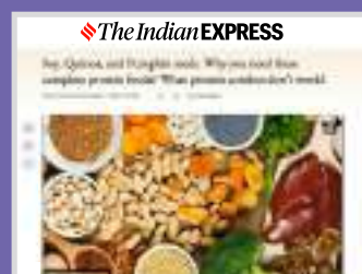
The Indian Express