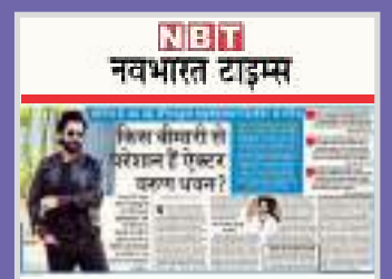
Nav Bharat Times